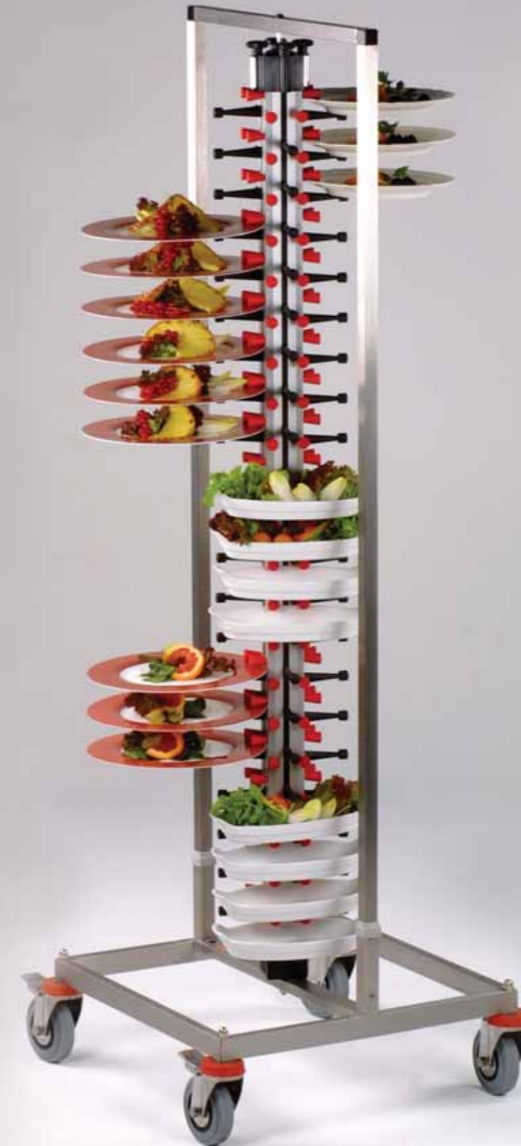
PLATE MATE PRE PLATED MEAL TROLLEY

Tel: 01642 242228 Web: www.richardsonsuk.co.uk